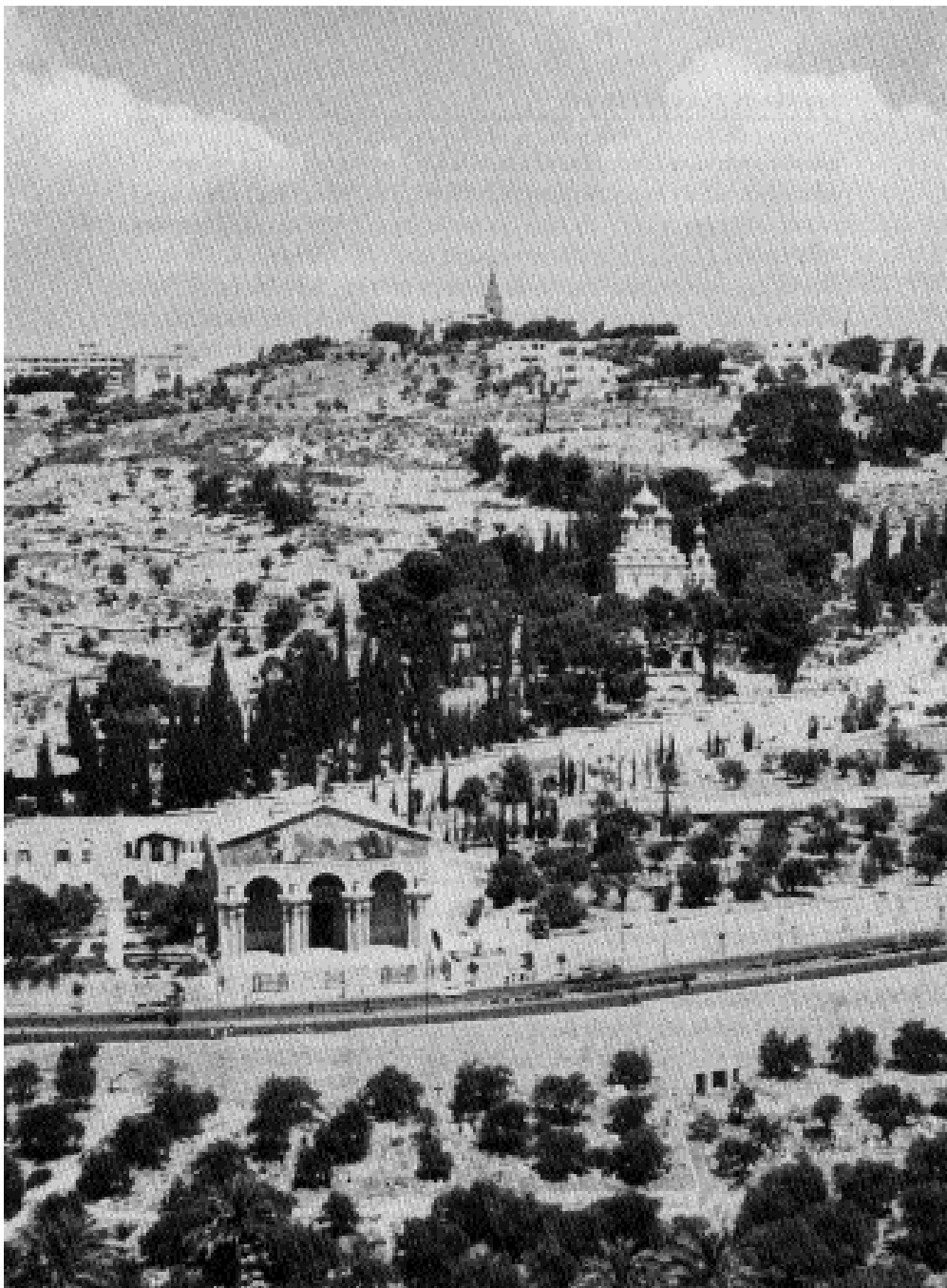
THE MOUNT OF OLIVES as it looks today. It is at this very location that Jesus Christ will soon return to earth to set up a peaceful and just world government.

life from God. Instead he chose to rely on himself and his own mind to guide his life and solve all his problems. To this very day, the nations and the leaders of this world still try to rely on themselves and human attempts at solution of their escalating problems. The world still refuses to rely on God.