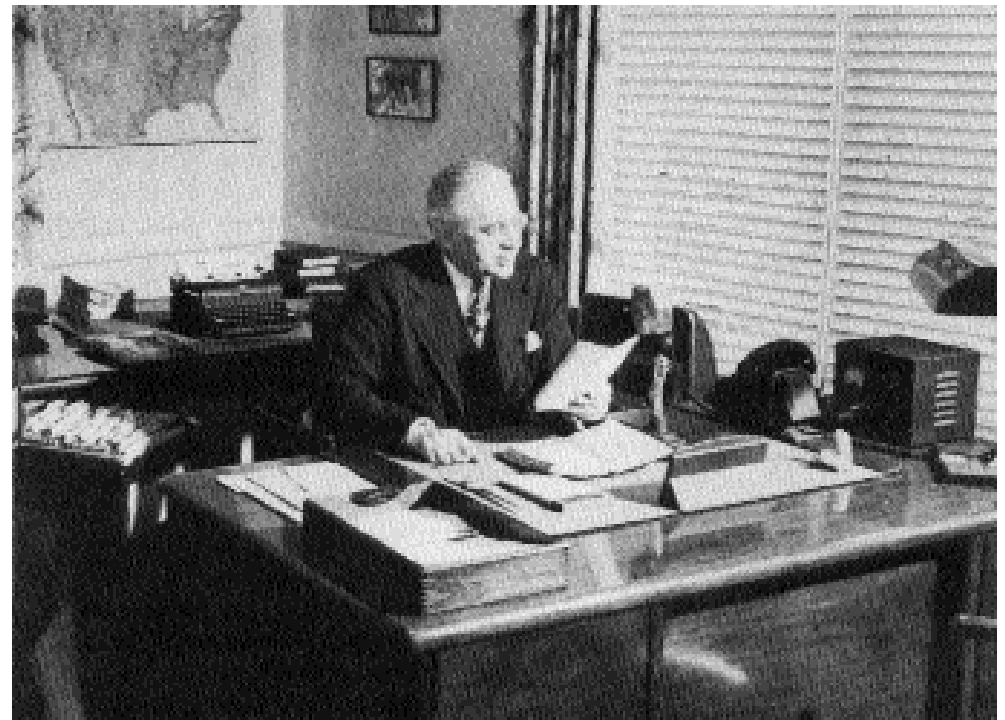
PHOTO SHOWS Herbert W. Armstrong making an early World Tomorrow radio broadcast. From the smallest beginnings, God's work has grown to international scope, carrying the true gospel to all the world as a final end-time witness.

Jesus came as a messenger from God bearing a message about the coming kingdom of God to take over and rule all nations.